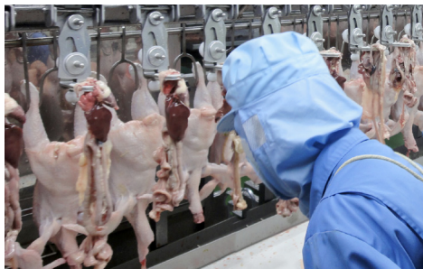
Transfer of giblet pack to further processing

The Eviscerator model 218 delivers the right quality to the sub-processes by removing the giblet pack in an efficient and safe way without compromising the quality of the chicken. The Eviscerator model 218 offers the following features at a glance: