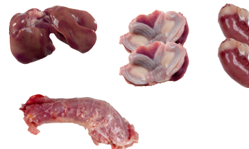
Giblets after harvesting